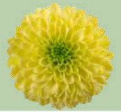
AAA Doria Cream