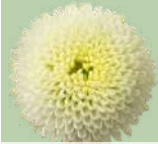
Madiba® White Pompon