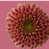
AAA Doria Cherry