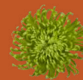
Anastasia® Dark Green