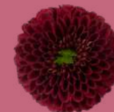
AAA Purpetta Red