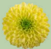
AAA Doria Cream