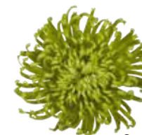
Anastasia® Dark Green