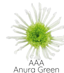
AAA Anura Green