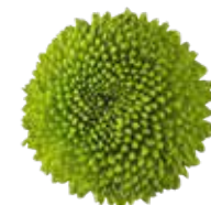
Feeling Green Dark