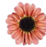
Yin Yang® Smokey