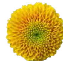
AAA Jeanny Orange